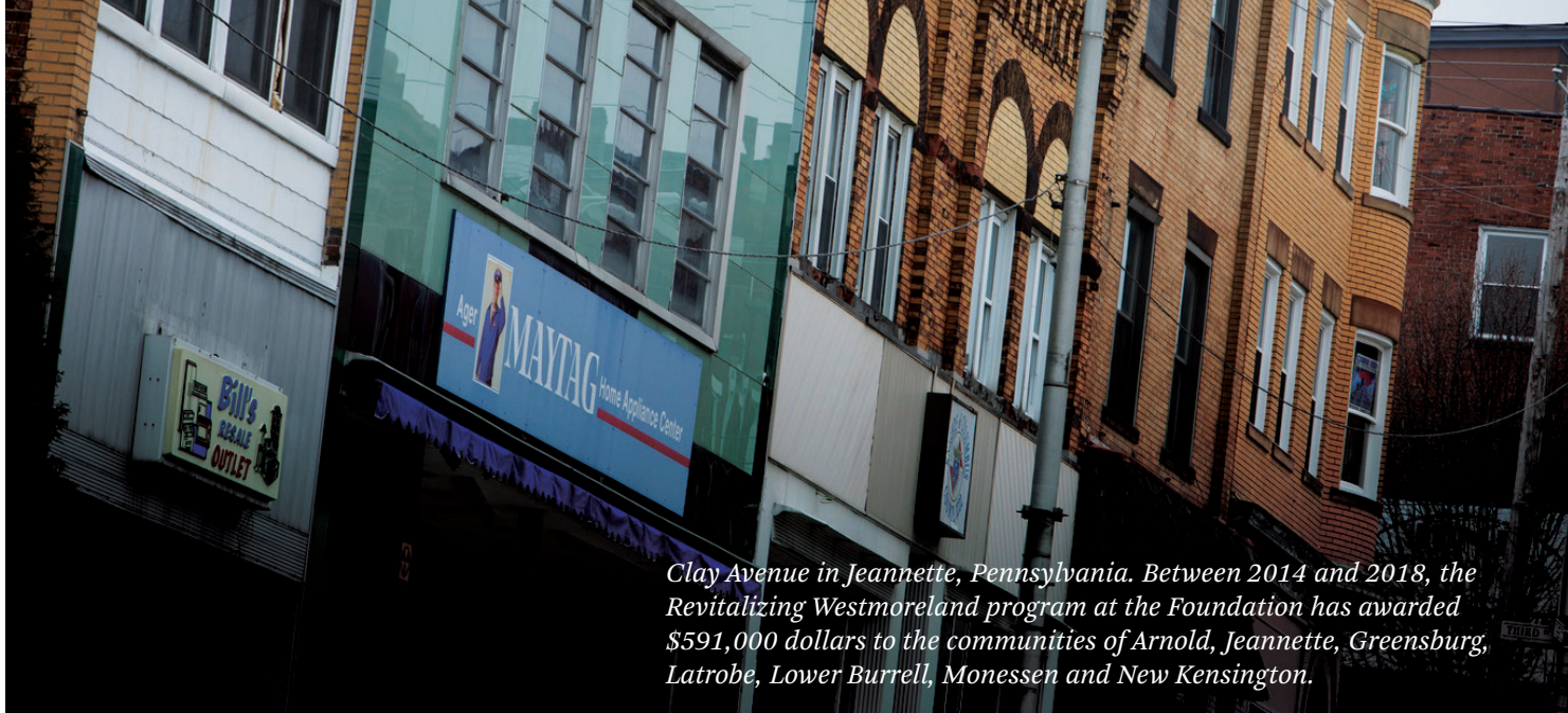
Clay Avenue in Jeannette, Pennsylvania. Between 2014 and 2018, the Revitalizing Westmoreland program at the Foundation has awarded $591,000 dollars to the communities of Arnold, Jeannette, Greensburg, Latrobe, Lower Burrell, Monessen and New Kensington.